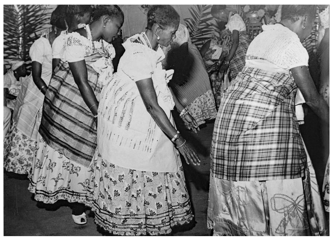
Figure 2. "Candomblé in Bahía (Brazil), a Ritual Dance," photographed in 1962 in a public history project sponsored by the Organization of American States. This image shows a group of women in traditional dress of African heritage engaged in dance as part of Candomblé religious ceremonies.

Communities within Brazil developed new beliefs and practices, called Macumba and Candomblé, through a blending of different African religions, Catholicism, and Indigenous cosmologies (Figure 2). Concepts drawn from the cultures of the BaKongo, Dahomey, and